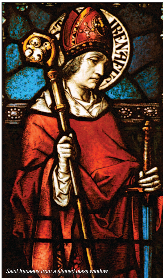
Saint Irenaeus from a stained glass window

the same throughout the whole world, so also the preaching of the truth shines everywhere and enlightens all men that are willing to come to a knowledge of the truth. Nor will any one of the rulers in the Churches, however highly gifted he may be in point of eloquence, teach doctrines different from these (for no one is greater than the Master); nor, on the other hand, will he who is deficient in power of expression inflict injury on the tradition.